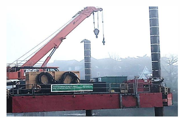
The jack-up barge in Arundel for working in water environments.

From 23 March 2020, you will start to see on-site activities increase at River Road. The main activities are highlighted on the plan overleaf.